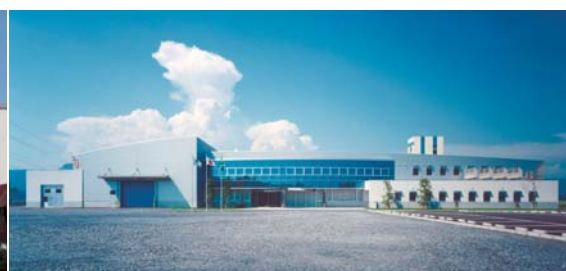
Techno Park Factory