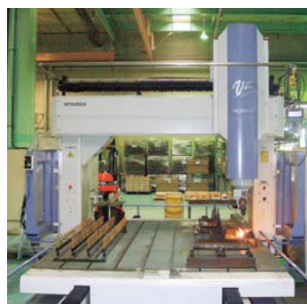
Laser beam machine